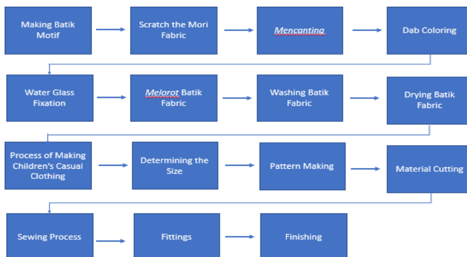
Picture 3. Line of Work

The stage of making the work is the stage for realizing the concept, basis and design into a work in accordance with the design plan that has been calculated to match the predetermined theme. The stage of making a work has stages starting from the beginning of the work process to the finishing stage of the work. The following are the stages of the work: