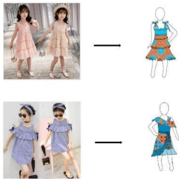
Picture 2. Fashion Exploration

The first process in fashion exploration is to look for references about the forms of children's casual clothing. Furthermore, the creators made several alternative designs for children's casual clothing which were then consulted with the final project supervisor and the best design was chosen. The form of casual children's clothing in this final work is designed with a simple form of clothing but still looks attractive and is comfortable for children to wear. Clothing is designed with a combination of ready-to-wear fabrics, including silk cotton, lady cloth, corn skin cloth, fine tile cloth and mell rose cloth as trousers. The colors used are bright colors adapted to the cheerful character of children.