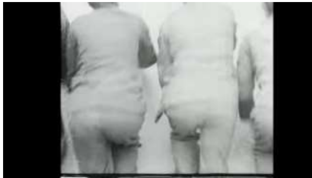
Figure 1. “ Vormittagsspuk/Ghosts Before Breakfast ” (Source: Hans Richter, 1928)

possibility of a transformed future (J. A. Buckley & Tsai, 2020). The Dada movement left a devastating impression on the art world – the shock waves of which can still be found in today's artistry and artists (Whohadada, 2020).