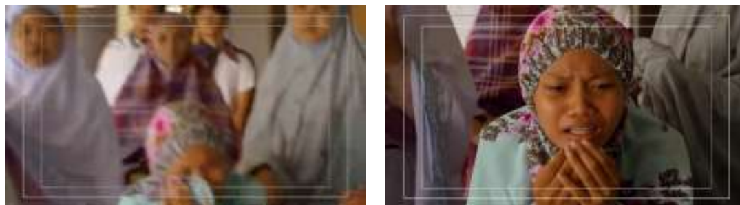
Figure 4. Live action-documentary

Actors have time to share their personal (authentic) experiences that are memorable, whether they are positive, negative, or inspiring. Every time he tell a story, each actor is surrounded by other actors who listen to him as a manifestation that actually each person still cares about the condition that is happening to him. His gaze is directly fixed on the camera, using the logic of the fourth wall as a direct action to film viewer-spectator to make it appear that they are not keeping their distance and creating intimacy. The gestures are without direction (director's work) and recorded simply (still camera) in order not to break their concentration. However, there is a certain situation in one of the scenes that have been shown above, the camera movement was even immediately moved by the director (Sito Fossy Biossa) spontaneously without the process of cropping the image during post production (editing), destroying the neatness of the film to show the real situation without the intervention of the editor, there is only the capture of pure emotion from the actor or storyteller character. The intentional shot shows a symbol of honesty and "purity" of the younger generation who have been damaged by bad situations and circumstances.