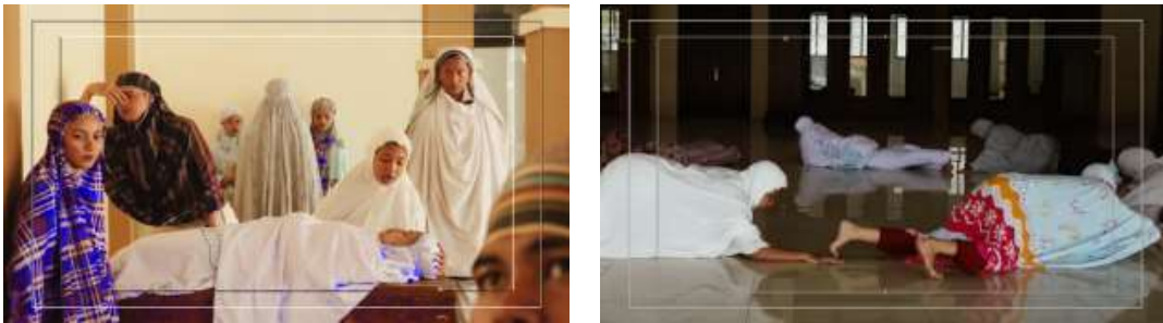
Figure 3. Live action

The film begins with the opening in the form of documentary footage showing the arrival of the bus to hint at the memories of the young people who were in the pick-up process (associated as a trap) by the terrorists. Later this young generation is planned to be their new agent. The director deliberately added a frame to the main screen to make it look like a visual in their "radar" (camera recording) monitoring. This shows that young people from many areas are being targeted by individuals, looking calm but full of supervision.