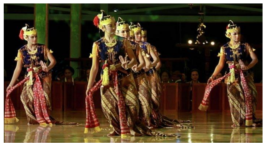
Fig. 7. The costume of the Bedhaya Bedhah Madiun dance Mangkunegaran style at the time it was performed at the Mangkunegaran Performing Art in 2013

plated jamang is a museum collection on display inside at nDalem Ageng Pura Mangkunegaran. Instead, the design used resembles a jamang for the lanyap character in the puppet.