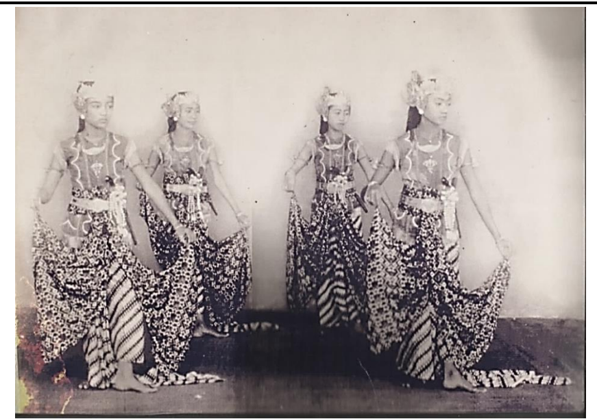
Fig. 4. The pose of tinting arms in srimpi (also in bedhaya ) dance Yogyakarta style absorbed by Mangkunegaran

According to Hastuti (1983), the difference in presentation style between the Bedhaya Bedhah Madiun dance in Mangkunegaran with bedhaya dance Yogyakarta style appears in the processing of movement techniques or anatomical coordination. Hastuti gave examples of some differences between Bedhaya Bedhah Madiun dance Mangkunegaran style and bedhaya dance Yogyakarta style, have obtained from R.Ngt. Waluyo Suryosuwito. Here are some of these differences,