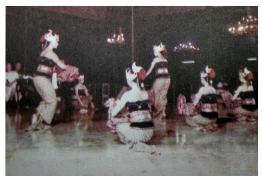
Fig. 6. Bedhaya Bedhah Madiun dance in Mangkunegaran used a mekak clothes design