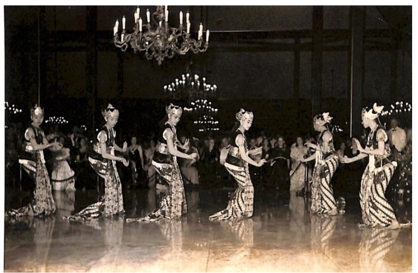
Fig. 5. Performance of Bedhaya Bedhah Madiun dance during the reign of Mangkunegara VII

Make-up had used in the Bedhaya Bedhah Madiun dance in Mangkunegaran is corrective makeup that beautifies the face by not using godheg and sogokan . It is different from the corrective makeup on the bedhaya dance Yogyakarta style, which uses godheg and sogokan made of velvet decorated with a gim and ketep. The outfit used was a sleeveless vest (kotangan) with a jamangan hairdo. The jamang took the style from Kasultanan Kanoman Cirebon (Soeryosoeyarso and Darmawan 1992, 18). The costume's design used samparan, so it significantly differs from Yogyakarta style. Samparan cloth design is the bedhava dance commonly used the bedhaya dance Surakarta style while bedhaya dance Yogyakarta style uses seredan cloth design. Bedhaya Bedhah Madiun dance uses a samparan cloth design with the same function as the bedhaya dance Surakarta style. The winding direction in the samparan cloth design same as the winding direction in seredan, it's different with samparan in the bedhaya dance Surakarta style. Samparan in kapang-kapang movement and sila position functioned like seredan to fulfill ethical and aesthetic values, and the direction samparan winding equated with the direction of seredan winding.