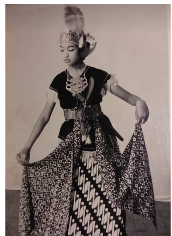
Fig. 3. The pose of tinting arms in bedhaya and srimpi dance Yogyakarta style

The innovation of the Bedhaya Bedhah Madiun dance Yogyakarta style in Mangkunegaran does not change the structure movements series had used. It had done by changing some of the implementation techniques of pose element and movement element, forming the sequence of movements. Based on the study of photography and videography, the movement patterns between Bedhaya Bedhah Madiun dance and srimpi dances in Mangkunegaran (absorbed from KBW) with the dance of bedhaya and srimpi in Yogyakarta style has no significant difference. Photography studies show the pose element have used almost the same. Researchers assume this is because Mangkunegaran's dancers learn directly from primary sources with a goodly learning system. The different cultural (dance) problems between Mangkunegaran and Yogyakarta can be resolving (although not completely), so they do not significantly influence presentation style changes.