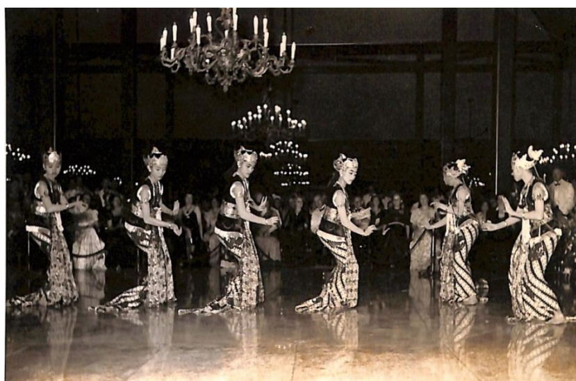
Fig. 5. Performance of Bedhaya Bedhah Madiun dance during the reign of Mangkunegara VII

Make-up had used in the Bedhaya Bedhah Madiun dance in Mangkunegaran is corrective make-up that beautifies the face by not using godheg and sogokan . It is different from the corrective make-up on the bedhaya dance Yogyakarta style, which uses godheg and sogokan made of velvet decorated with a gim and ketep . The outfit used was a sleeveless vest ( kotangan ) with a jamangan hairdo. The jamang took the style from Kasultanan Kanoman Cirebon (Soeryosoeyarso and Darmawan 1992, 18). The costume's design used samparan , so it significantly differs from the bedhaya dance Yogyakarta style. Samparan cloth design is commonly used in the bedhaya dance Surakarta style while bedhaya dance Yogyakarta style uses seredan cloth design. Bedhaya Bedhah Madiun dance uses a samparan cloth design with the same function as the bedhaya dance Surakarta style. The winding direction in the samparan cloth design same as the winding direction in seredan , it's different with samparan in the bedhaya dance Surakarta style. Samparan in kapang-kapang movement and sila position functioned like seredan to fulfill ethical and aesthetic values, and the direction samparan winding equated with the direction of seredan winding.