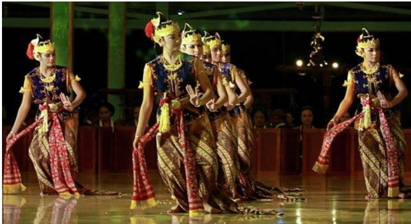
Fig. 7. The costume of the Bedhaya Bedhah Madiun dance Mangkunegaran style at the time it was performed at the Mangkunegaran Performing Art in 2013

plated jamang is a museum collection on display inside at nDalem Ageng Pura Mangkunegaran. Instead, the design used resembles a jamang for the lanyap character in the puppet.