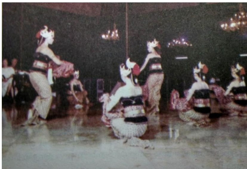
Fig. 6. Bedhaya Bedhah Madiun dance in Mangkunegaran used a mekak clothes design