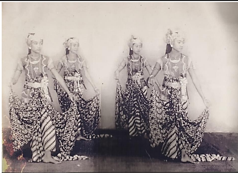
Fig. 4. The pose of tinting arms in srimpi (also in bedhaya ) dance Yogyakarta style absorbed by Mangkunegaran

According to Hastuti (1983), the difference in presentation style between the Bedhaya Bedhah Madiun dance in Mangkunegaran with bedhaya dance Yogyakarta style appears in the processing of movement techniques or anatomical coordination. Hastuti gave examples of some differences between Bedhaya Bedhah Madiun dance Mangkunegaran style and bedhaya dance Yogyakarta style, have obtained from R.Ngt. Waluyo Suryosuwito. Here are some of these differences,