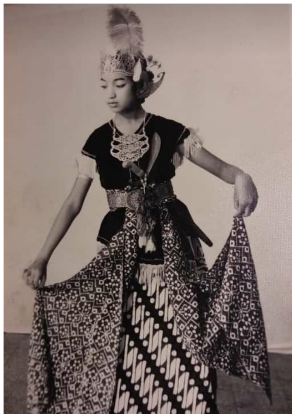
Fig. 3. The pose of tinting arms in bedhaya and srimpi dance Yogyakarta style

The innovation of the Bedhaya Bedhah Madiun dance Yogyakarta style in Mangkunegaran does not change the structure movements series had used. It had done by changing some of the implementation techniques of pose element and movement element, forming the sequence of movements. Based on the study of photography and videography, the movement patterns between Bedhaya Bedhah Madiun dance and srimpi dances in Mangkunegaran (absorbed from KBW) with the dance of bedhaya and srimpi in Yogyakarta style has no significant difference. Photography studies show the pose element have used almost the same. Researchers assume this is because Mangkunegaran's dancers learn directly from primary sources with a goodly learning system. The different cultural (dance) problems between Mangkunegaran and Yogyakarta can be resolving (although not completely), so they do not significantly influence presentation style changes.