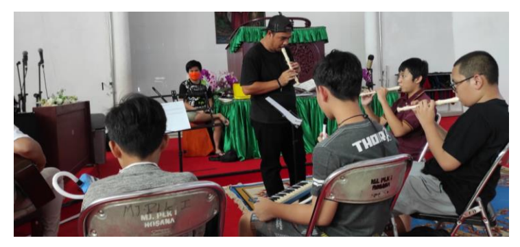
Fig. 3. Music Ensemble in Cycle II

The implementation of the second cycle is a follow-up action to the research on developing musical ensembles at GKE Palangka I. In this cycle, the researchers continue their efforts to improve the participants' skills based on the results of reflections from the actions of the first cycle, Fig 3 is the music ensemble in cycle II. From the implementation of the second cycle, the following results were obtained in Table 4.