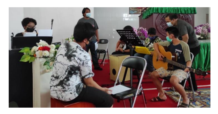
Fig. 2. Music Ensemble in Cycle 1

Fig. 2 is Music Ensemble in Cycle 1. If we look at the assessment aspect, it is found that the average for each aspect of the assessment is in a suitable category. However, the aspect of tempo suitability needs special attention because it has not met the standard of success. This aspect will then be used as evaluation material to improve the implementation of cycle II.