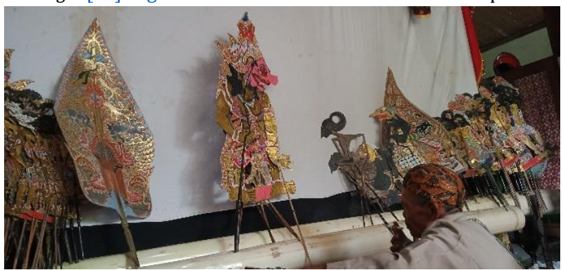
Fig 1. Bathara Kala in Ruwat Murwakala performance

The murwakala story conveyed that after giving Bathara Kala permission to eat the human Sukerta , Bathara Guru advised Bathara Kala that if one day he meets someone who can read the inscriptions (mantras) on four parts of his body, that means that someone is older and more powerful than Bathara Kala . When he had to submit to whatever he ordered [26]–[29]. The mantra reading stage is the core of the ruwat murwakala ritual because this section presents the symbolism of the process of 'taming' Bathara Kala [30]. The writings on Bathara Kala 's forehead, chest, throat, and backbone are known as the Sastra Bathuk , Sastra Dhada , Sastra Telak , and Sastra Gigir [11]. Fig 1 is Bathara Kala in Ruwat Murwakala performance.